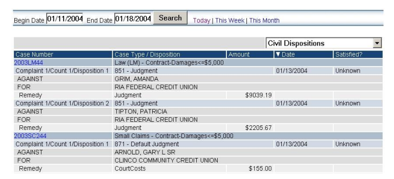
Civil dispositions for a given time period