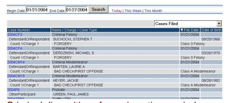
Criminal dispositions for a given time period